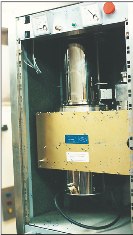
Bext L4 Transmitter. The front access cover is removed, showing PA assembly.

A couple of years ago I helped install and maintain a Bext L10. I later had the opportunity to consult on the installation of an L7.